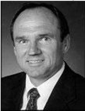
Sen. Dan Kapanke