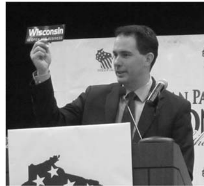
Wisconsin Is Open For Business