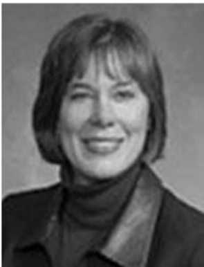
Sen. Sheila Harsdorf