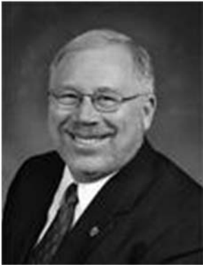
Sen. Luther Olsen