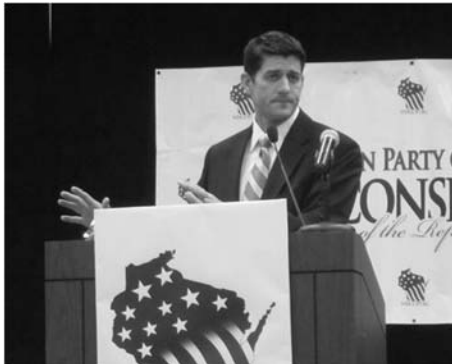
Rep. Paul Ryan speaks to the convention